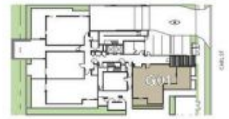
GROUND KEY LEGEND (NOT TO SCALE)