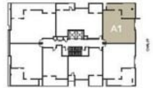
LEVEL 10 KEY LEGEND (NOT TO SCALE)